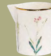
Botanical Milk Jug 48BA20 Pk:(6) 20cl / 7 oz