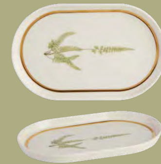
Botanical Oval Plate 11CP18 Pk:(6) 18cm / 7"