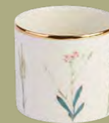
Botanical Sugar Bowl 388188 Pk:(6) 18cl / 6oz