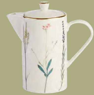
Botanical Coffee Pot 938185 Pk:(6) 85cl / 28 oz