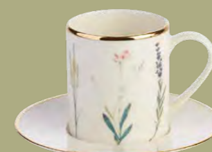
Botanical Cup & Saucer 328123 Pk:(6) 25cl / 8 1 / 2 oz 138116 Pk:(6) 16cm / 6 1 / 4 "