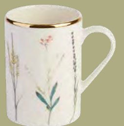
Botanical Mug 428128 Pk:(6) 30cl / 10 1 / 2 oz