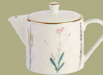
Botanical Teapot 938150 Pk:(6) 50cl / 17 oz