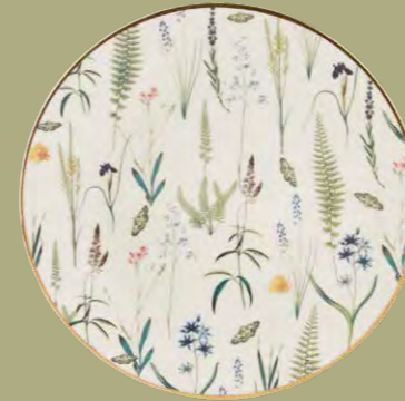
Botanical Plates 187826 Pk:(6) 26cm / 10 1 / 4 " 187821 Pk:(6) 21cm / 8 1 / 4 " 187817 Pk:(6) 17cm / 6 1 / 2 "