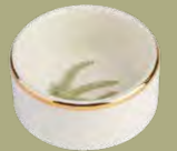
Botanical Ramekin 358107 Pk:(6) 7cm / 2 3 / 4 "