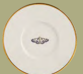
Botanical Saucer 138116 Pk:(6) 16cm / 6 1 / 4 "