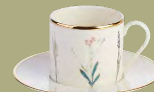
Botanical Cup & Saucer 328119 Pk:(6) 18cl / 6 oz 138116 Pk:(6) 16cm / 6 1 / 4 "